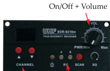
Channel switch LED A & B

The LEDs A and B are lightning when the UHF link between transmitter and receiver is ok. Channel can be changed with the switch on the left side.