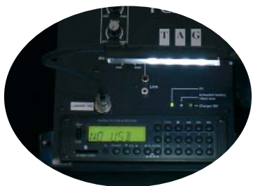
Flash/L1 Lamp Littlite with LED