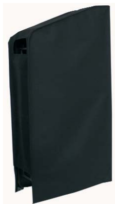
Bag for Flash