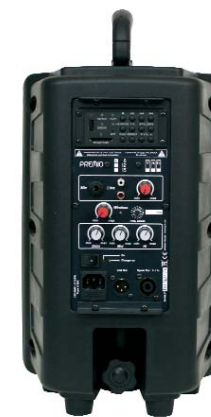
UHF amplified sound system Premio