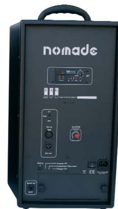
UHF amplified sound system Nomade

The RP-6016M transmitter enables the link between Flash / A and other active sound systems (Nomade UHF, Premio UHF,...) or another sound system with a rackable UHF receiver (SDR 1816SC)