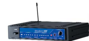
UHF rackable receiver SDR 1816 C