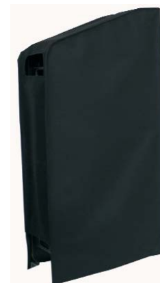
Bag for Flash