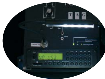
Flash/L1 Lamp Littlite with LED