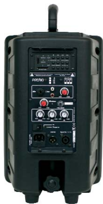
UHF amplified sound system Premio