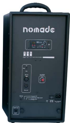
UHF amplified sound system Nomade

The RP-6016M transmitter enables the link between Flash / A and other active sound systems (Nomade UHF, Premio UHF,...) or another sound system with a rackable UHF receiver (SDR 1816SC)