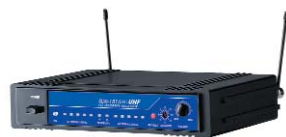
UHF rackable receiver SDR 1816 C