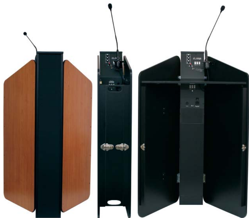
Example of a Flash/A with a built-in UHF receiver module, a Wireless transmitter RP 6016 M UHF and CD/MP3/USB player