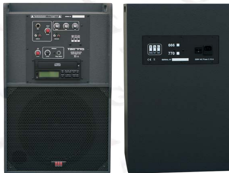
Example of one TAG770, front and backside, equipped with one CD player.