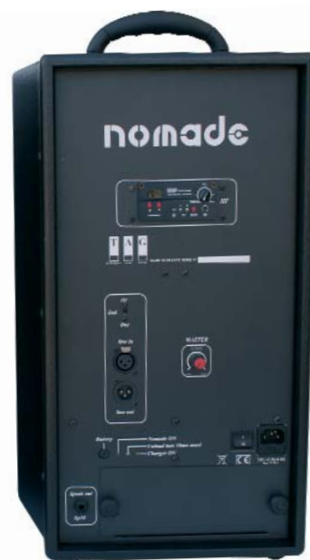
Example : NOMADE